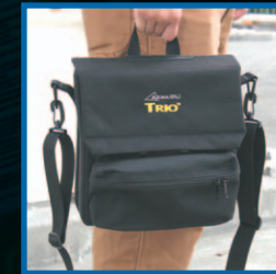
Shoulder Soft Case