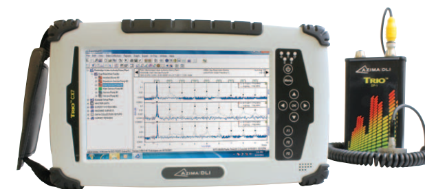
TRIO CX7 tablet, data processor and triaxial vibration sensor

TRIO TM has arrived and is demonstrating that there is a better way to implement machine condition monitoring. TRIO is more than a vibration data collector; it is a powerful computerized system in a mobile industrial package that sets aside the traditional data collection model and brings forth a new focus on ergonomics, efficiency and safety. TRIO will improve the effectiveness of your condition monitoring program and will allow you to get more done in less time with a high degree of success while lowering the overall cost of your program.