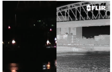
24-hour Vision: Your Vision vs. FLIR Vision