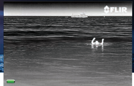
Search and Rescue: Security in Emergencies

Compared to monocular (one eyepiece) cameras, the BHM-Series's unique bi-ocular (dual eyepiece) design is less tiring to use over long missions, easier to hold steady on rough waters, and gives you greater range performance. Plus, its Video Out connection makes it easy to connect to an onboard monitor or DVR.